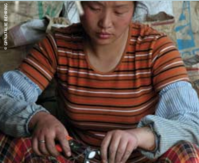
GUIYU, CHINA - 8 MARCH 2005 - A MIGRANT WORKER STRIPS WIRES FROM E-TRASH IN A JUNK YARD IN GUIYU IN GUANGZHOU PROVINCE.