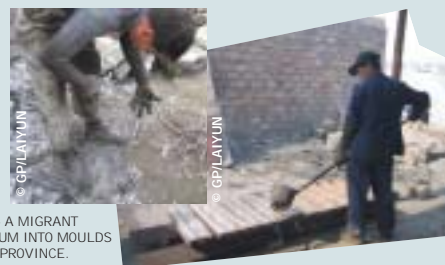
MUYU, CHINA - 13 FEBRUARY 2004 - A MIGRANT WORKER POURING LIQUID ALUMINIUM INTO MOULDS IN MUYU, TAIZHOU CITY, ZHEJIANG PROVINCE.

Contamination of the environment beyond the workplace was also indicated by the results of analysis of street dusts from several locations around the recycling district of Shashtri Park in Delhi, compared to those of two other, more residential areas. Although results for heavy metals were somewhat less conclusive, three of the four road dusts collected in the Shashtri Park area contained traces of PCBs, chemicals which were not detectable in road dust from either Kailashnagar or Safourjung districts.