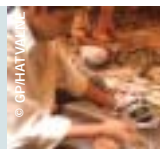
DELHI, INDIA - 11 AUGUST 2005 - YOUNG WORKERS AT AN E-WASTE RECYCLING YARD IN DELHI.