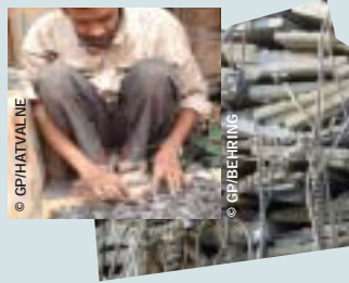
GUIYU, CHINA - 9 MARCH 2005 - A STACK OF OLD KEYBOARDS AND OTHER E-WASTE IN NANYANG, CHINA.

conclusions Although clearly not an exhaustive study of “e-waste” recycling facilities in either country, the results summarised above do provide an illustration of the breadth and scale of health and environmental concerns arising from this industrial sector. Both wastes and hazardous chemicals used in the processing are commonly handled with little regard for the health and safety of the workforce or surrounding communities and with no regard for the environment. Overall, the result is severe contamination of the workplace and adjacent environment with a range of toxic metals and persistent organic contaminants.